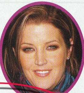
LISA MARIE PRESLEY

Thanks to good genes, Lisa Marie has a natural advantage for fighting wrinkles. But since every little bit helps, she uses the City Face Skin Remodeler to keep her skin smooth. $59, sephora.com.