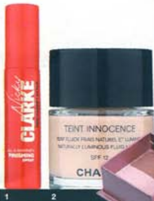
Kate Winslet's tousled hair needs a light hold, like Nicky Clarke's Finishing Spray, £5.49